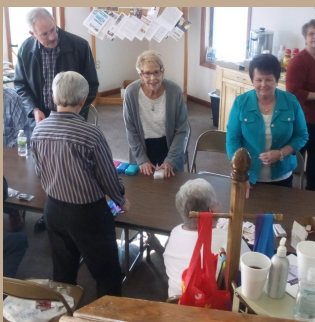
SOCIETY AND ZONE NEWS