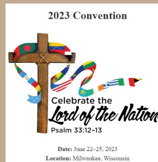
MEET THE YWRS