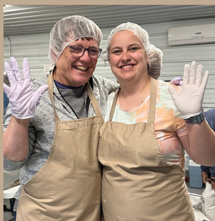
SEEK AND SERVE