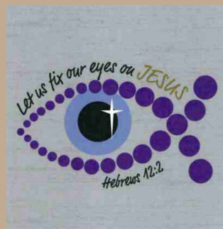
2022 DISTRICT CONVENTION Everything Convention