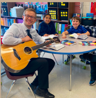
MISSION GRANTS Hispanic Ministry