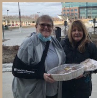
SOCIETY AND ZONE NEWS Service with a smile