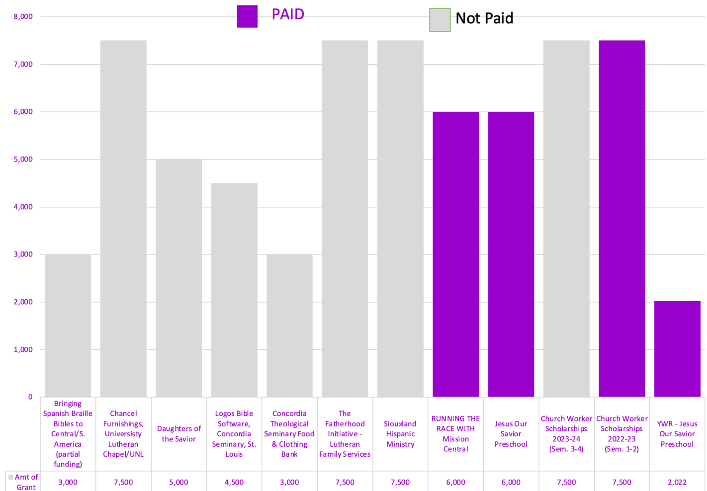
Nebraska North Mission Grants 2022-2024

Note: Grants in Purple Indicate that they are PAID