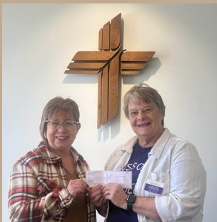
MISSION FUNDS PRESENTED