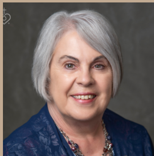
2024 DISTRICT CONVENTION