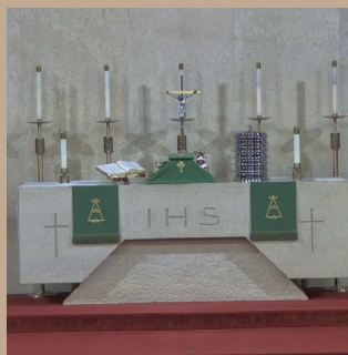
WORSHIP SERVICE SATURDAY MORNING