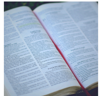
BIBLE STUDY LED BY REV. MORENO