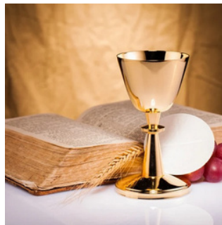
WORSHIP SERVICE SATURDAY MORNING