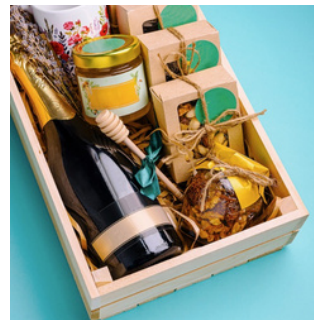
PURPLE AUCTION FOR MITES