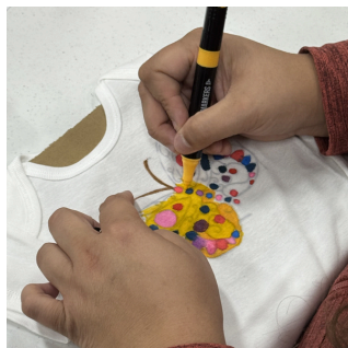
SEEK AND SERVE