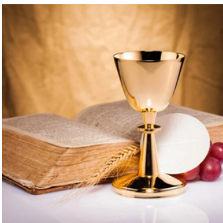
2026 DISTRICT CONVENTION